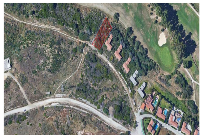
PLANO DE SITUACIÓN